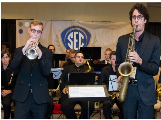
SEC student jazz musicians perform at the 2015 SEC Symposium.

SEC student jazz musicians will comprise a special music ensemble scheduled to perform at two events during the 2016 SEC Football Championship weekend in Atlanta.